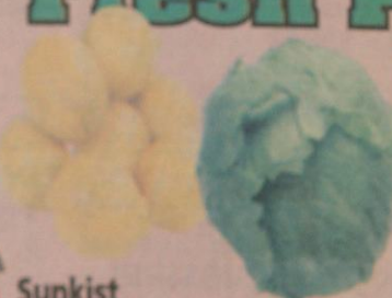
Sunkist Jumbo Size Lemons.....