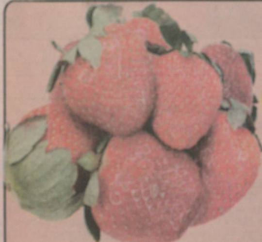
Fresh Red Ripe Strawberries