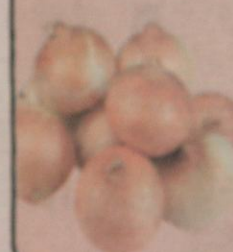
Vidalia Jumbo Sweet Yellow Onions.....