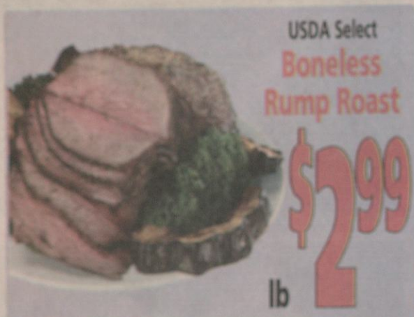
USDA Select Boneless Rump Roast

Your Hometown Store Bringing You Low Prices On Multiple Items 52 Weeks A Year