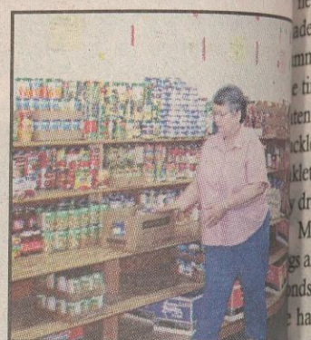
photo id and your household don't hesitate to let you don't have information with you during times. If you like to make to the Helpful Food Pantry donation box. If you would like a monetary address is Helpful Food Pantry Iuka, MS 38852.

The Helpful Samaritan Food Pantry is open. We are doing things a little differently. You stay in your vehicle, we come to you get your information and come back with your box of food. Our volunteers said to keep open "The Pantry" because there are so many more people needing help. So we are wearing a mask and gloves to keep you and us safe. We are all in this together and we are here to help you. The Helpful Samaritan Food Pantry is open Monday's 11:00 - 12:30 and Thursday's 4:00 - 5:30. If this is your first visit for this year please bring your