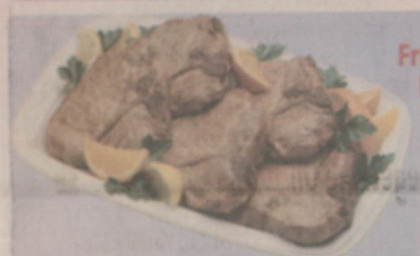
USDA Inspected Fresh Assorted Pork Chops