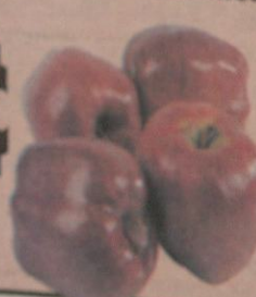
Washington Extra Fancy Red Delicious Apples.....