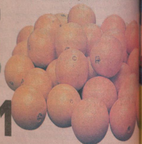
California Sunkist Seedless Navel Oranges