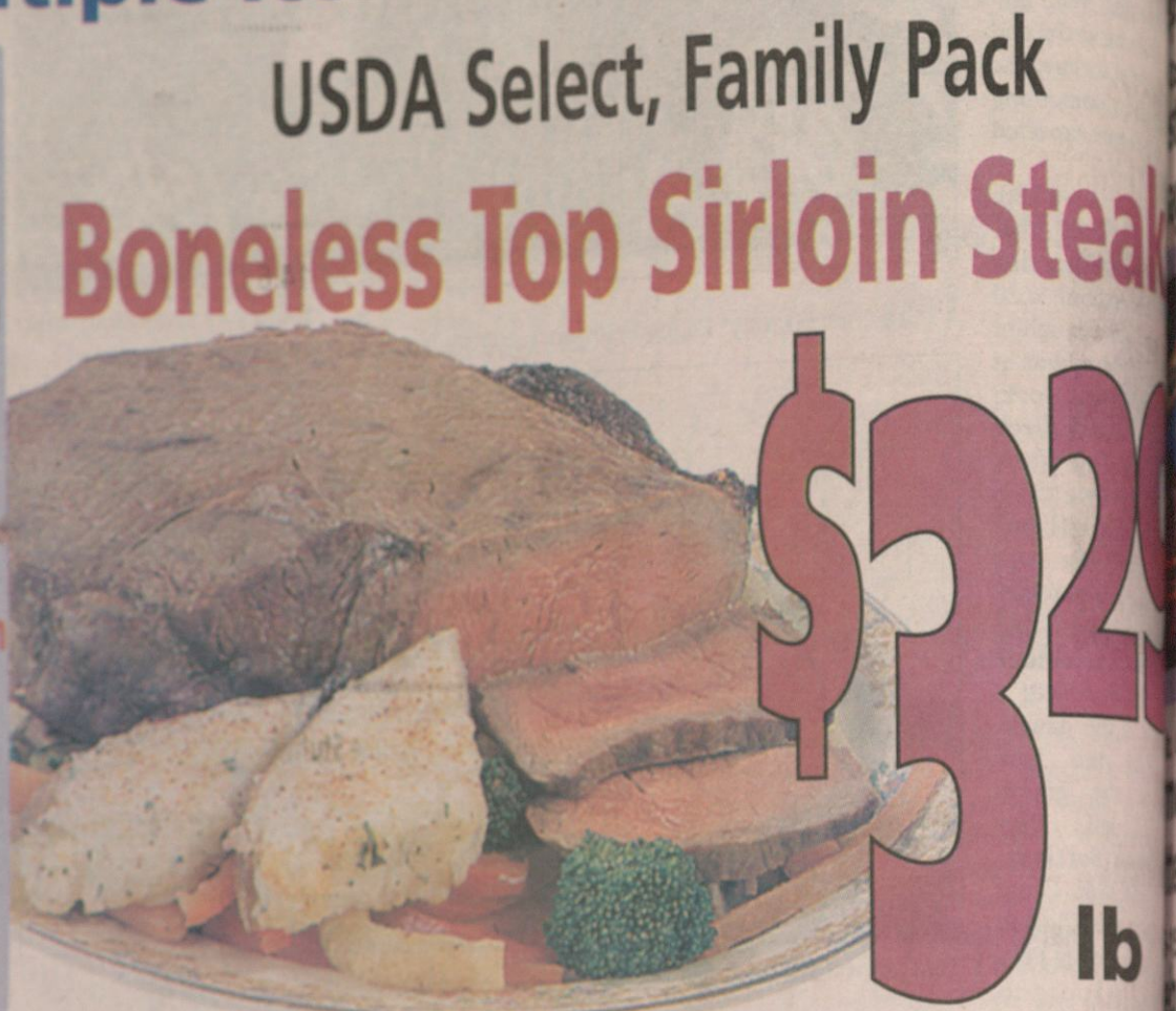
USDA Select, Family Pack