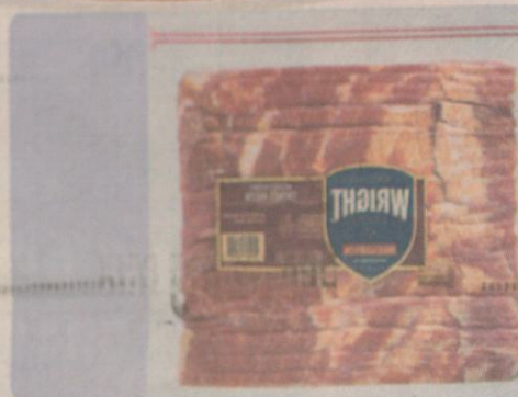
40 Oz. Pkg. Wright Hickory Smoked Bacon