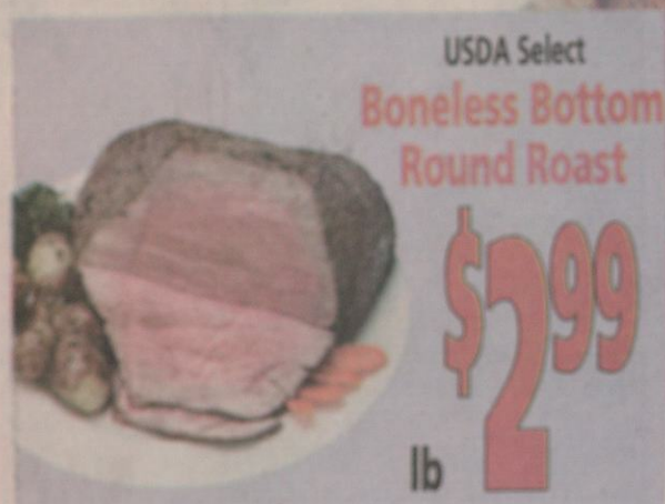
USDA Select Boneless Bottom Round Roast